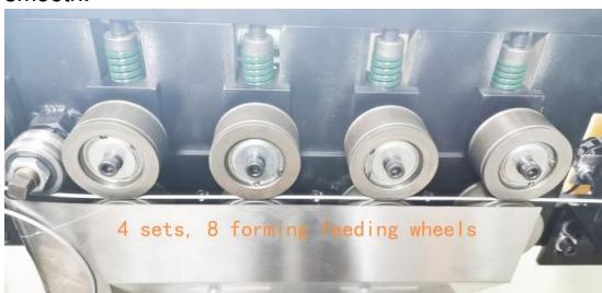
4 sets, 8 forming feeding wheels

Assembly workshop of all-in-one circular butt welding machine